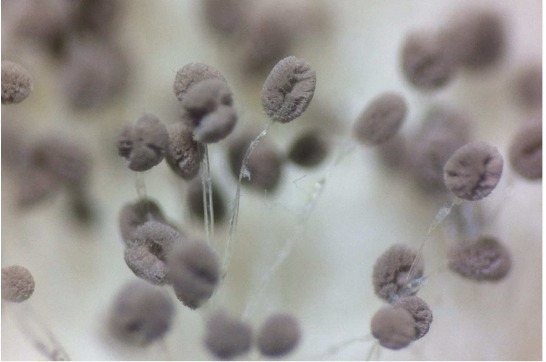
Transgenic fungus shows huge promise for malaria control in West Africa