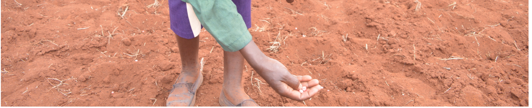
Kenya plants demonstrations of insect-resistant GMO maize